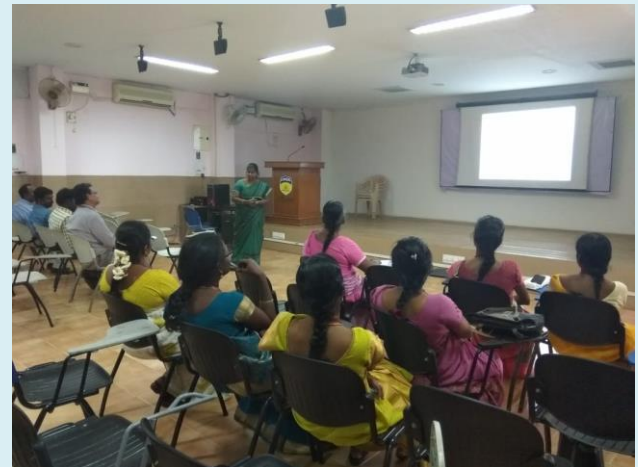
Audience listening the seminar

The individual nodes in a wireless sensor network (WSN) are inherently resource constrained: they have limited processing speed, storage capacity, and communication bandwidth. After the sensor nodes are deployed, they are responsible for self-organizing an appropriate network infrastructure often with multi-hop communication with them. Then the onboard sensors start collecting information of interest. Wireless sensor devices also respond to queries sent from a “control site” to perform specific instructions or provide sensing samples. The working mode of the sensor nodes may be either continuous or event driven. Global Positioning System (GPS) and local positioning algorithms can be used to obtain location and positioning information. Wireless sensor